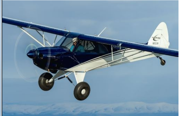
New Rotax 916iS/c powered Carbon Cub UL from CubCrafters.

Lakeland, Florida, March 28, 2023 – BRP-Rotax, a subsidiary of BRP Inc. (TSX:DOO; NASDAQ:DOOO), is proud to achieve a new level of performance with the launch of its Rotax 916iS/c aircraft propulsion system, which makes it perfectly suitable for four-seater planes and for high performance two-seaters. At 85.8 kilograms and a powerful 160 hp, the 916iS/c offers an unprecedented power-to-weight ratio in the light aircraft segment and is available with an impressive 24-volt option for more cockpit features and comfort. The Rotax 916iS/c made its debut today at the SUN 'n FUN Aerospace Expo in Lakeland, Florida, showcasing its power for the first time ever in a CubCrafters aircraft, a new customer of BRP-Rotax.